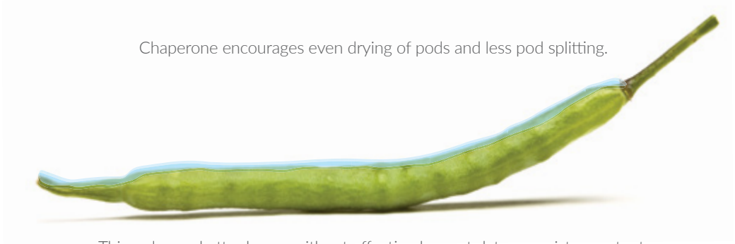
This reduces shatter losses without effecting harvest date or moister content.